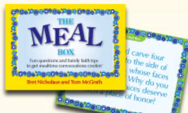
The Meal Box (set of cards) www.loyolapress.com

Fun questions and family faith tips spark dinnertime discussions