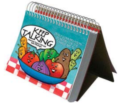
Keep Talking (Conversation Starters for the Family Meal) www.ligouri.org