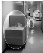
Obstructed exit route